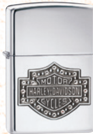
28349 NEW Emblem High Polish Chrome