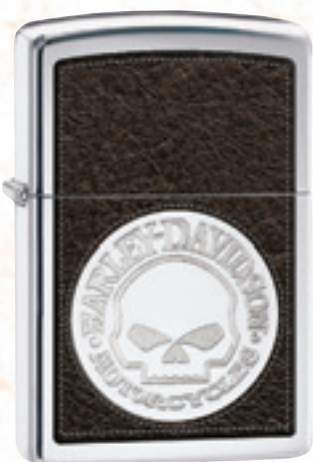
28484 NEW High Polish Chrome