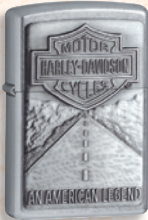
20229 Emblem Street Chrome