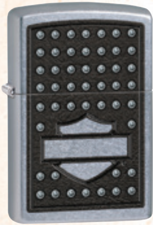
28482 NEW Street Chrome