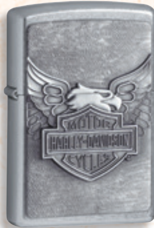
20230 Emblem Street Chrome