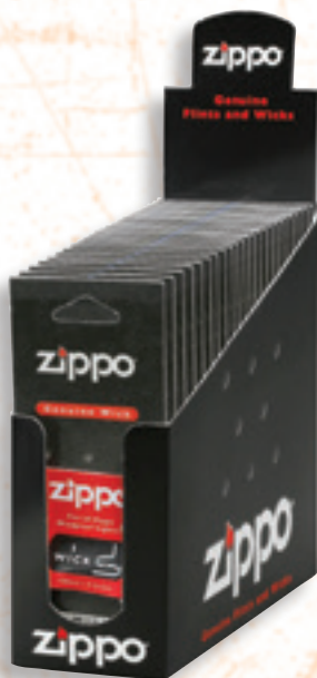
2425 Wick Cards - 24 cards per display box; 24 boxes per master carton

For optimum performance of every Zippo windproof pocket lighter, we recommend genuine Zippo flints, wicks, and premium lighter fluid.