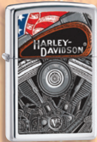
28081 High Polish Chrome