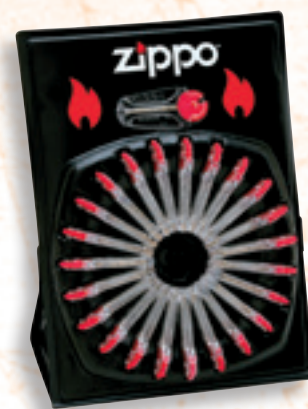
2406C Six Flint Dispenser - 24 per Display Card

For optimum performance of every Zippo windproof pocket lighter, we recommend genuine Zippo flints, wicks, and premium lighter fluid.