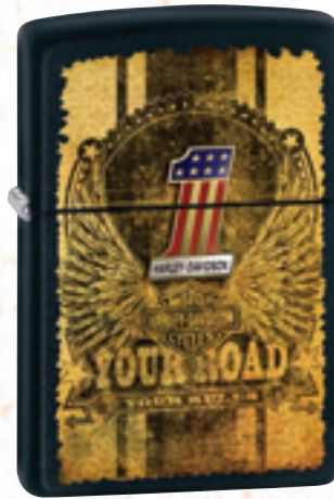
28350 NEW Black Matte