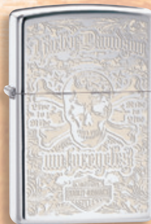
28229 High Polish Chrome