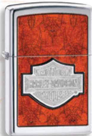
28266 High Polish Chrome