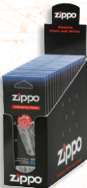
2406N Flint cards - 24 cards per display box; 24 boxes per master carton