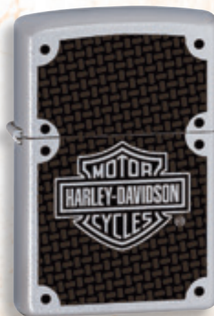
24025 Satin Chrome