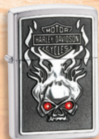
28267 Emblem Brushed Chrome