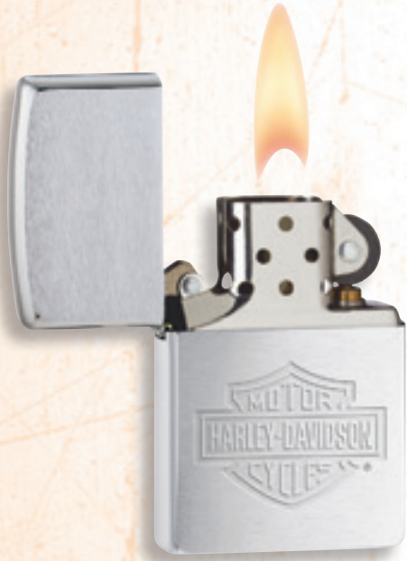
200HD.H199 Brushed Chrome