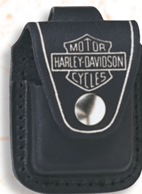
HDPBK H-D® Lighter Pouch w/ Loop - Black