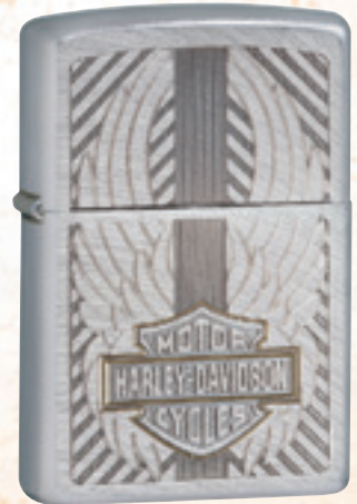
28486 NEW Chrome Arch