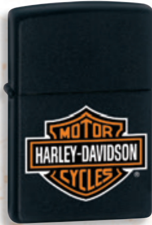
218HD.H252 Black Matte