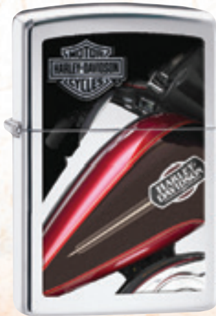
28483 NEW High Polish Chrome