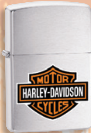
200HD.H252 Brushed Chrome