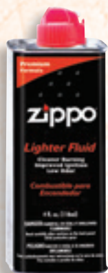
3141 Lighter Fluid 4 oz. (shipping carton of 24)