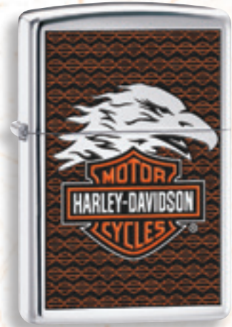
28265 High Polish Chrome