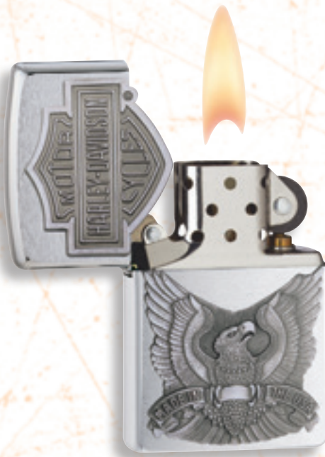
200HD.H284 Emblem Brushed Chrome