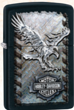
28485 NEW Black Matte