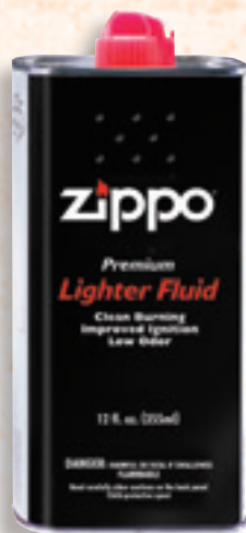
3165 Lighter Fluid 12 oz. (shipping carton of 24)