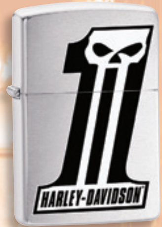
28228 Brushed Chrome