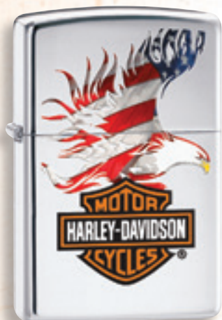
28082 High Polish Chrome