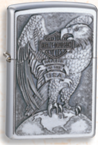
200HD.H231 Emblem Brushed Chrome