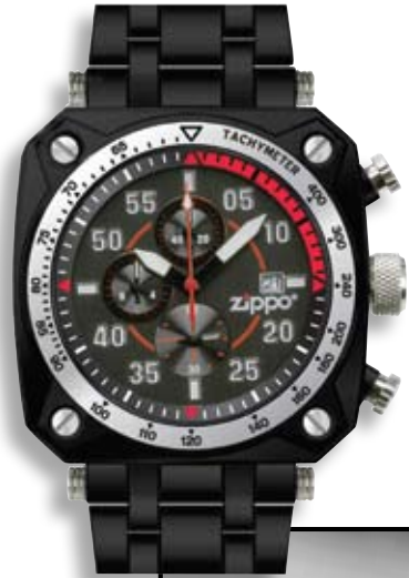
45.5 x 55 mm