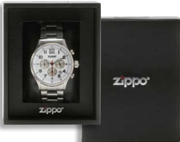
STANDARD PACKAGING FOR ZIPPO WATCHES.

This Warranty gives you specific legal rights which are in addition to, but run concurrently with, any other legal rights which you may have under the statutes of a state, province or country, and does not limit those statutory rights.