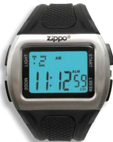
45 x 49.5 mm