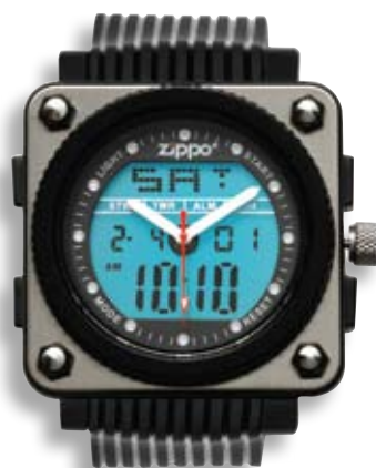
42.5 x 54 mm