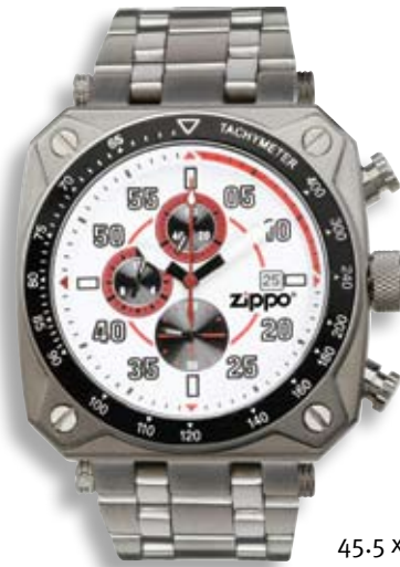
45.5 x 55 mm