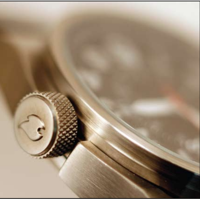
Flame-embossed crown with screw-in action.