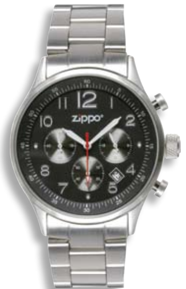
42.5 x 49 mm