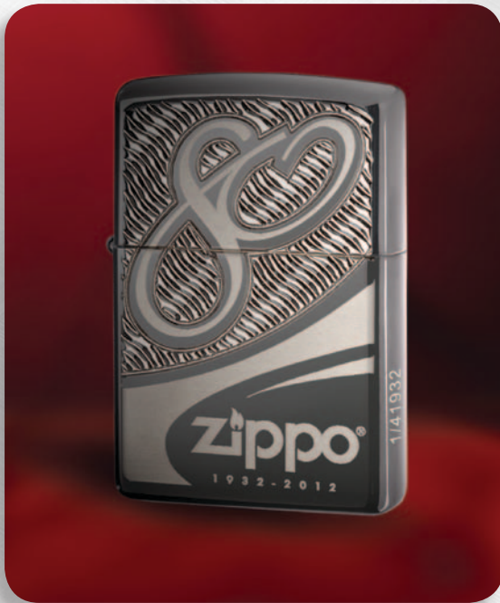
28249 Armor Black Chrome