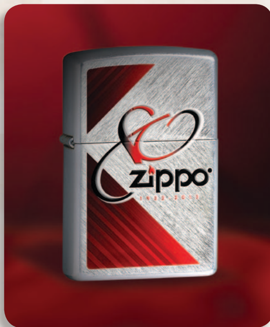
28192 Herringbone Sweep