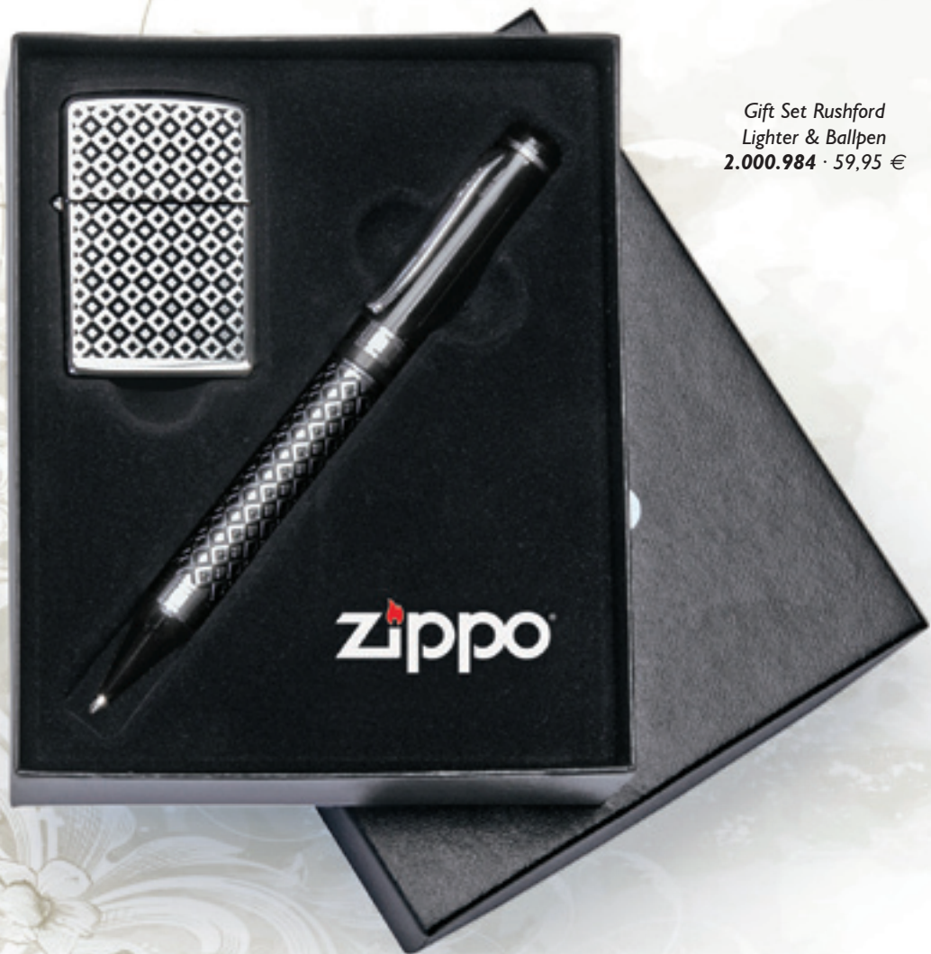
Gift Set Rushford Lighter & Ballpen 2.000.984 · 59,95 €