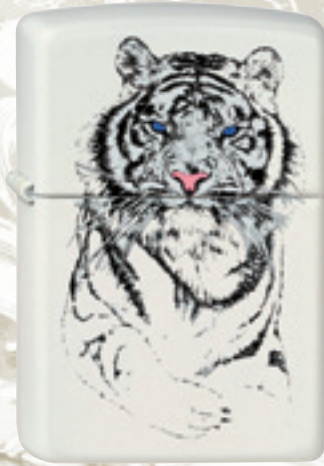
White Tiger 2.000.985 #214 · 39,95 €