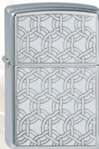
Chain Web 2.000.711 #250 · 39,95 €