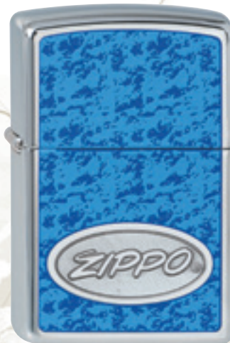
Zippo Blue Marble 2.000.708 #250 · 49,95 €

A charming combination of a surface imprint and a double lustre process which gives the zippo lighter an elegant aristocratic touch.