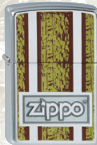
Yellow Lines Marble 2.000.709 #250 · 49,95 €