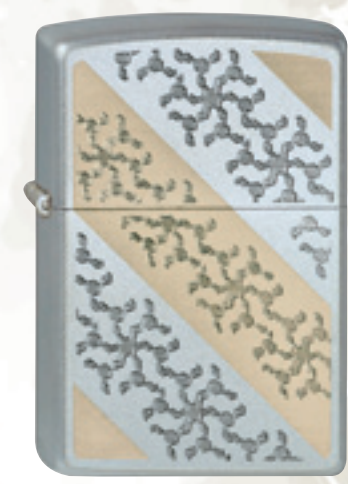
ZDNS Codebar 2.000.801 #250 · 42,95 €

Two processes combined on a zippo lighter. Computer and laser engraving gives the zippo lighter a luxury look.