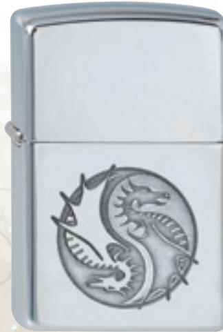
Dragon Circle 2.000.986 #250 · 39,95 €