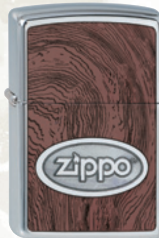
Zippo Wood 2.000.707 #250 · 49,95 €