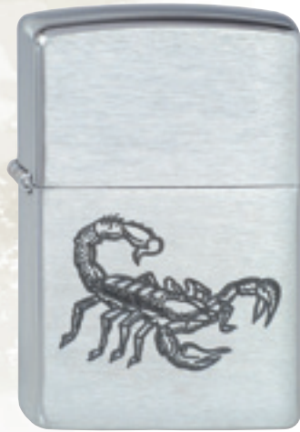
Scorpion 1.901.306 #200 · 31,- €