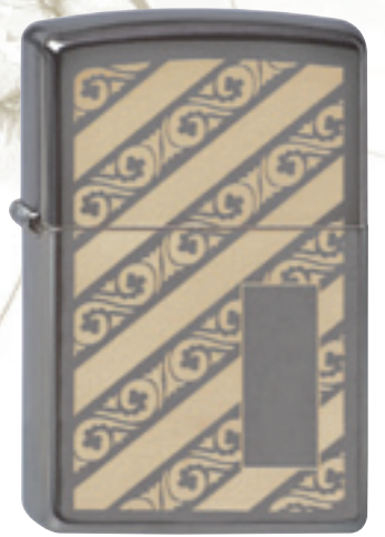
Venetian Scroll 2.000.839 #150 · 55,- €