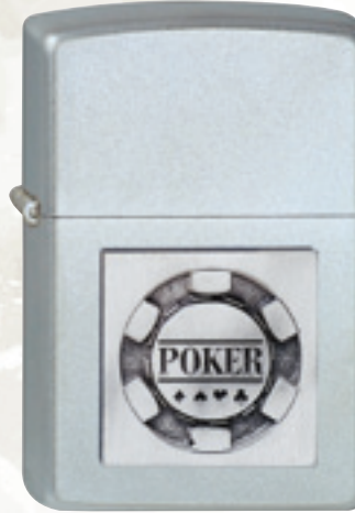
Poker 1.320.060 #205 · 39,95 €