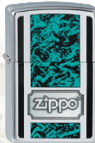
Zippo Green Marble 2.000.706 #250 · 49,95 €