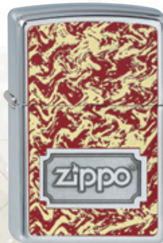
Zippo Red Marble 2.000.705 #250 · 49,95 €