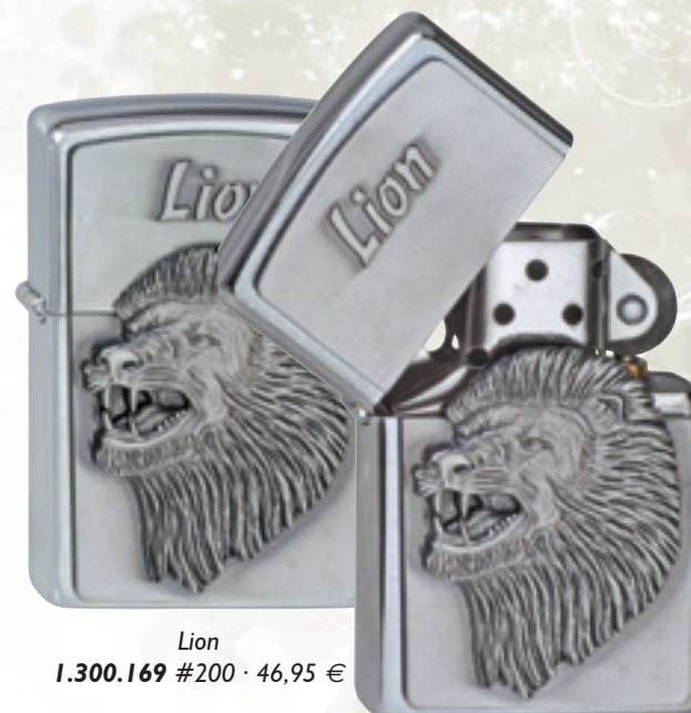
Lion 1.300.169 #200 · 46,95 €