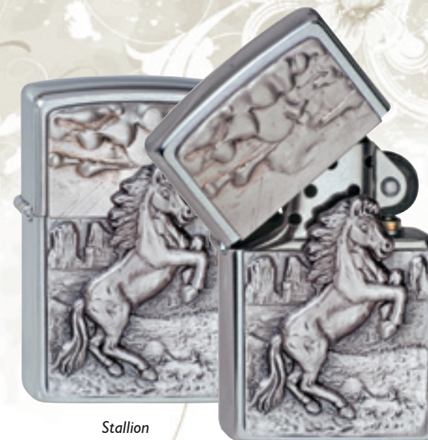
Stallion 1.300.168 #200 · 46,95 €