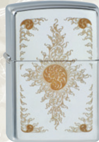
English Pattern 1.410.176 #250 · 42,95 €