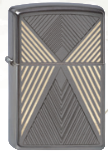
Geometrical Wings 2.000.795 #150 · 55,- €