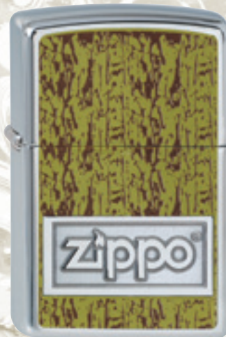
Zippo Yellow Marble 2.000.704 #250 · 49,95 €