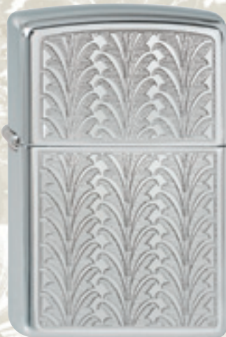
Floral Lines 2.000.796 #250 · 39,95 €