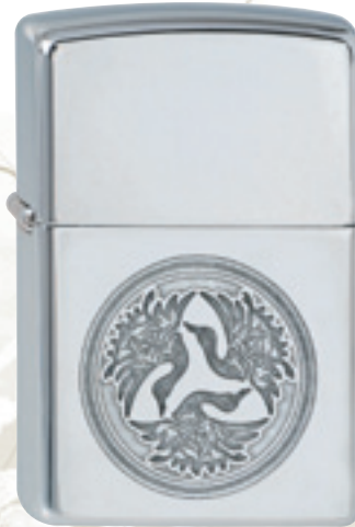
Birds Circle 2.000.988 #250 · 39,95 €