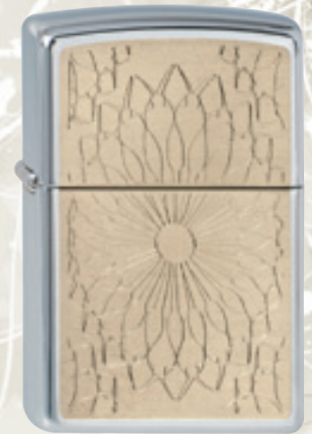
MandalaZ 2.000.805 #250 · 49,95 €