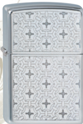
Cross Link 2.000.710 #250 · 39,95 €