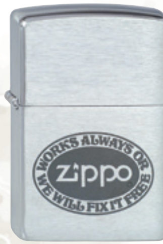
Zippo Always Works 1.901.314 #200 · 31,- €