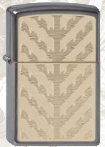
TreeZ 2.000.798 #150 · 55,- €