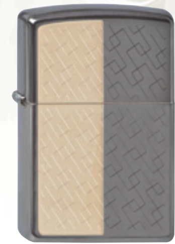
Night & Day Lines 2.000.794 #150 · 55,- €