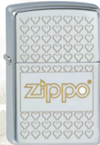
Multi Hearts 1.410.165 #250 · 39,95 €