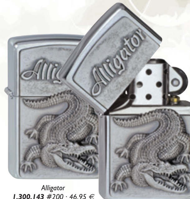
Alligator 1.300.143 #200 · 46,95 €