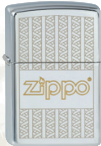
Zippo Arces 1.410.166 #250 · 39,95 €