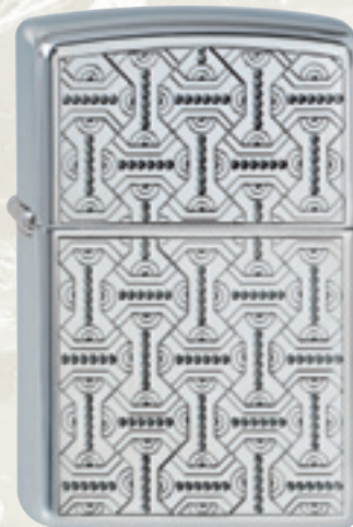
Cross Lines 2.000.712 #250 · 39,95 €