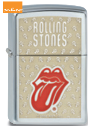
Rolling Stones 2.000.390 #250 · 49,95 €