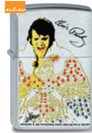
Elvis 2.000.373 #200 · 49,95 €