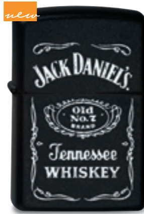
Jack Daniel's Old No 7 Brand 2.000.409 #218 · 41,95 €