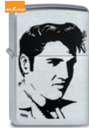
Elvis 2.000.374 #200 · 46,95 €