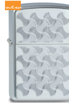
Eye Teaser 2.000.362 #250 · 41,95 €