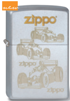
Zippo Racing 2.000.431 #205 · 39,95 €