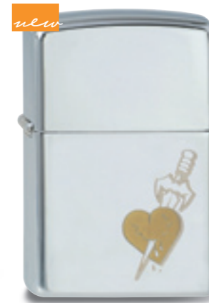
new Heart & Dagger 2.000.366 #250 · 41,95 €