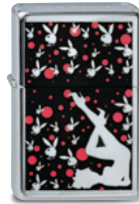
PB Crown Stamp 1.210.184 #250 · 49,95 €