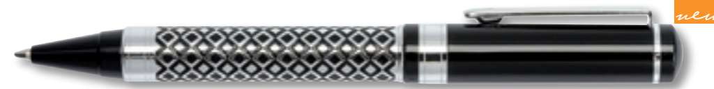
Ballpen Rushford · 2.000.134 · 29,95 €