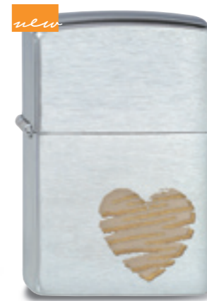
new Heart Design TwoTone 2.000.306 #200 · 39,95 €