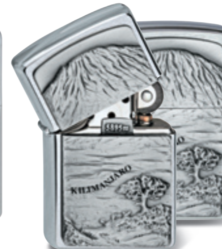
Kilimanjaro 2.000.213 #200 · 46,95 €