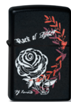
Rock of Ages 2.000.124 #218 · 46,95 €