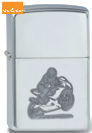
Motorcycle Racing 2.000.331 #250 · 41,95 €