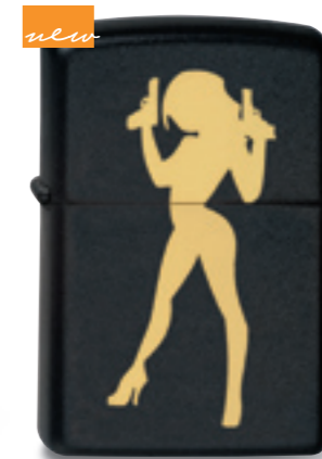
Lady & Guns 2.000.314 #218 · 41,95 €