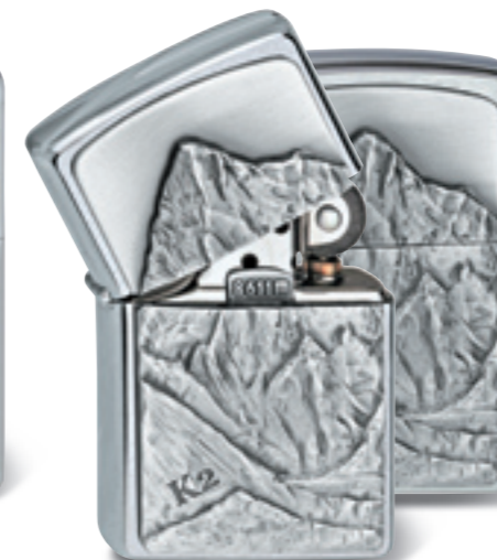
K2 2.000.216 #200 · 46,95 €