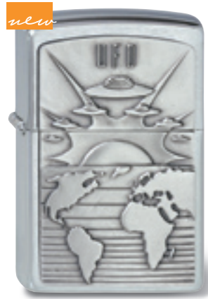
UFO 2.000.264 #200 · 46,95 €