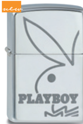
Playboy Rabbit Head 2.000.383 #250 · 49,95 €