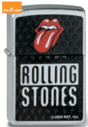
Rolling Stones 2.000.403 #207 · 46,95 €