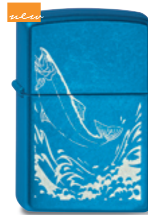
Flying Fish 2.000.330 #24534 · 46,95 €