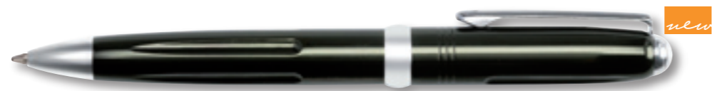
Ballpen Cazenovia · 2.000.126 · 29,95 €