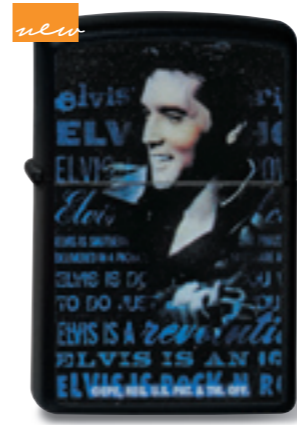
Elvis 2.000.388 #218 · 55,- €