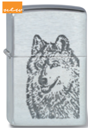
new Wolf 2.000.318 #200 · 39,95 €