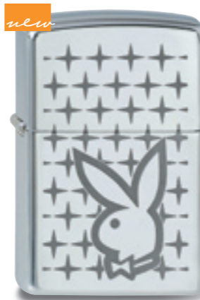
Playboy Diamonds 2.000.381 #250 · 49,95 €