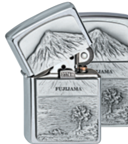
Fujijama 2.000.212 #200 · 46,95 €