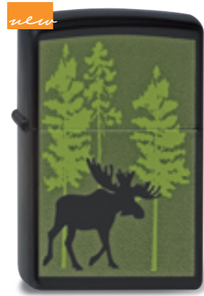
Moose in Woods 2.000.300 #218 · 41,95 €