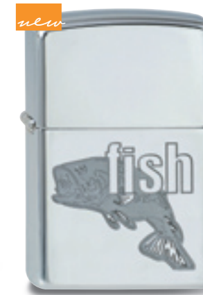
Fish 2.000.293 #250 · 41,95 €