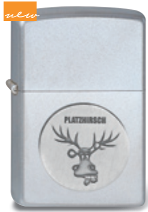
Platzhirsch 2.000.410 #205 · 36,50 €