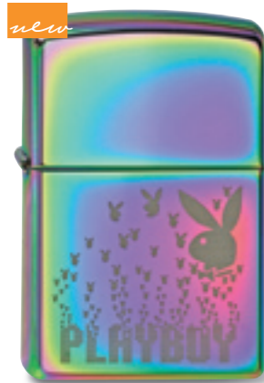
Playboy 2.000.384 #151 · 59,95 €