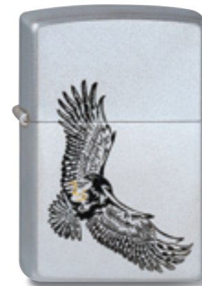
Eagle 1.420.053 #205 · 49,95 €