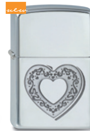
new Heart Design Filigree 2.000.301 #250 · 41,95 €