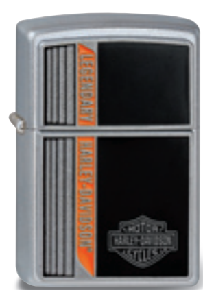
HD Legendary 1.320.087 #205 · 65,- €