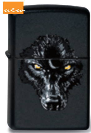
new Black Wolf 2.000.336 #218 · 55,- €