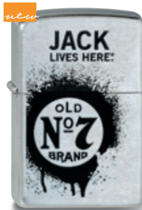
Jack lives here 2.000.417 #207 · 39,95 €