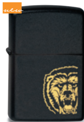
new Bear Growling 2.000.304 #218 · 35,- €

* © 2009 PB&J Design, Inc. All Rights are reserved. American Hardcore® is a registered Trademark of PB&J Design, Inc.