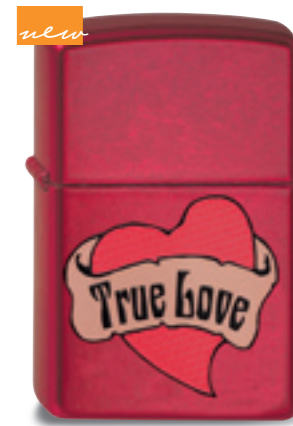
new True Love Heart 2.000.307 #21063 · 41,95 €