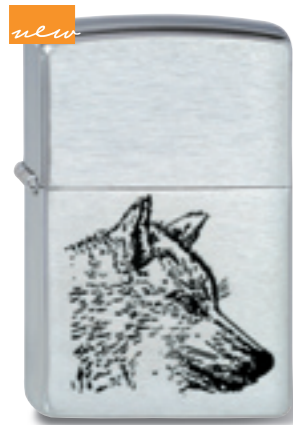
new Wolf Profile 2.000.332 #200 · 31,- €

* © 2009 PB&J Design, Inc. All Rights are reserved. American Hardcore® is a registered Trademark of PB&J Design, Inc.