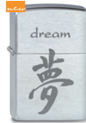
Japanese Signs Dream 2.000.305 #200 · 39,95 €