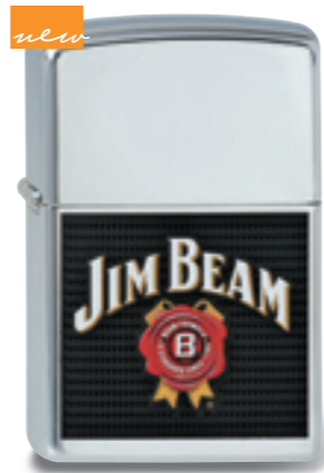
new Jim Beam 2.000.333 #250 · 49,95 €

Jim Beam is a registered trademark of Jim Beam Brands Co. and is used under authorized license to Zippo Manufacturing Company. All rights reserved worldwide. INTENDED FOR PURCHASE BY ADULTS OF LEGAL PURCHASE AGE FOR ALCOHOLIC BEVERAGES.