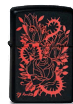
Rose 2.000.125 #218 · 46,95 €