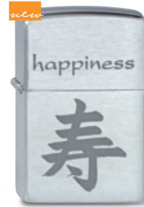
Japanese Signs Happiness 2.000.309 #200 · 39,95 €