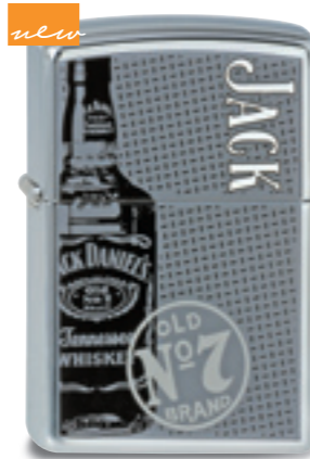
Jack Daniel's Old No 7 2.000.413 #250 · 49,95 €

JACK DANIEL'S and OLD NO. 7 are registered trademarks used under license to Zippo Manufacturing Company. © 2009, Jack Daniel's — All Rights Reserved. Your friends at Jack Daniels remind you to drink responsibly. For sale to adults of legal drinking age.