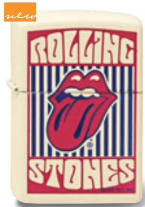
Rolling Stones 2.000.433 #216 · 46,95 €

© 2009 RSTE Inc. under license to CPI Touring (RS.06-USA), LLC Marketing by Anthill Trading Ltd.