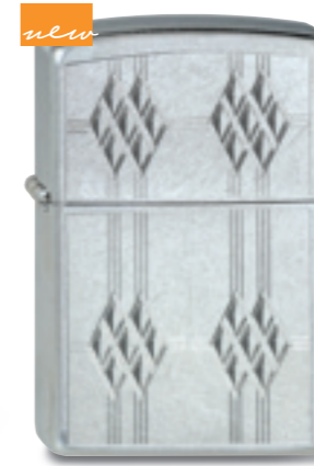
Diamond Windowpane 2.000.361 #207 · 39,50 €