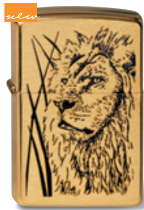
new Proud Lion 2.000.320 #204B · 46,95 €