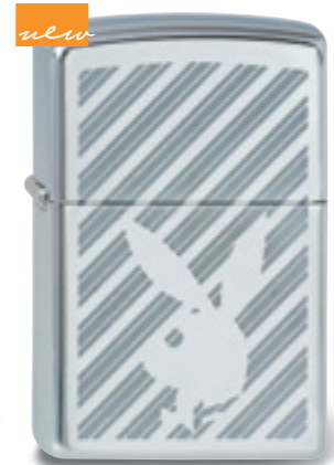
Playboy Lines 2.000.382 #250 · 49,95 €