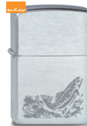
Fish Jumping 2.000.302 #200 · 31,- €