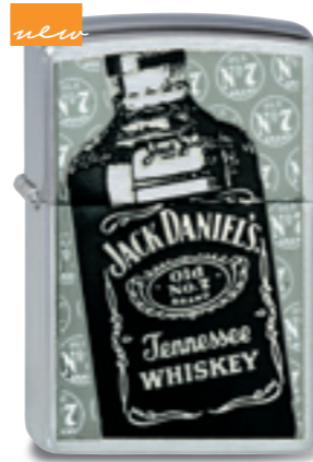
Jack Daniel's Bottle 2.000.411 #200 · 46,95 €