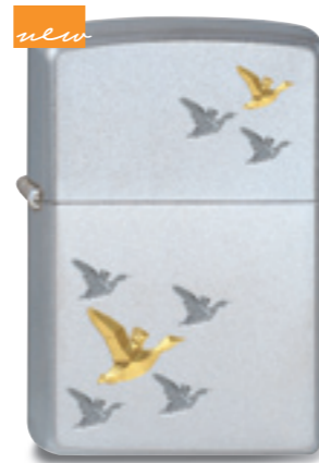
Flying Ducks 2.000.295 #205 · 35,- €