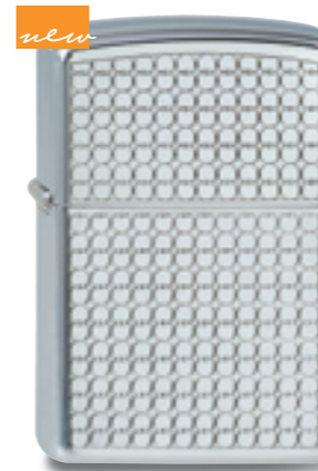
Circles 2.000.286 #250 · 41,95 €