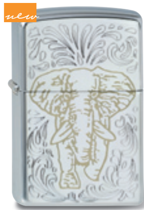
new Elephant 2.000.294 #250 · 41,95 €