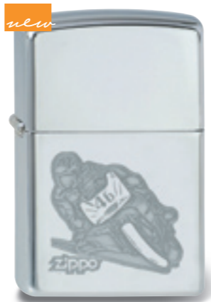
Zippo Motorcycle Racer 2.000.367 #250 · 41,95 €