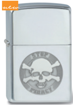
Stop Piracy 2.000.372 #250 · 41,95 €