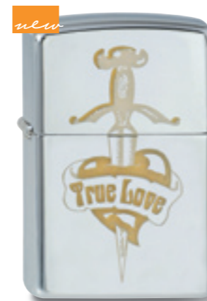
new True Love Sword 2.000.311 #250 · 41,95 €