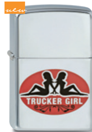
Trucker Girl 2.000.398 #250 · 39,95 €