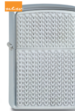
Hearts 2.000.287 #250 · 41,95 €