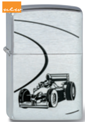
Racing Cars 2.000.365 #200 · 39,95 €