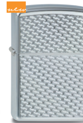
Squiggles 2.000.290 #250 · 41,95 €