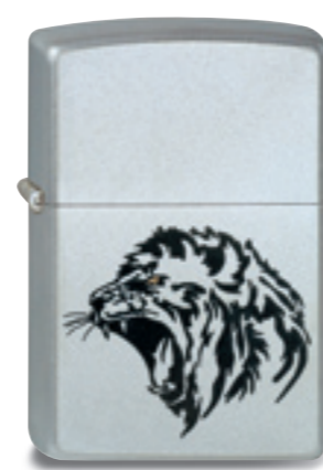
Lion 1.420.049 #205 · 49,95 €