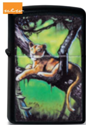
new Lion in Tree * 2.000.406 #218 · 49,95 €