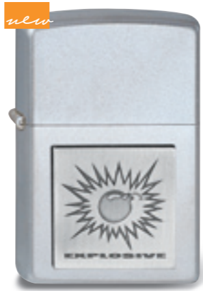
Explosive 2.000.414 #205 · 36,50 €