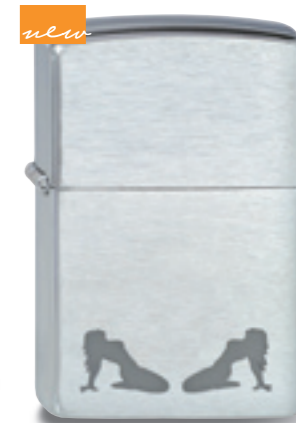
Ladies 2.000.292 #200 · 31,- €