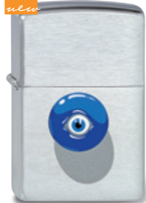
new Blue Eye 2.000.337 #200 · 49,95 €