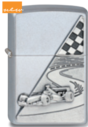
Race Car 2.000.399 #205 · 46,95 €