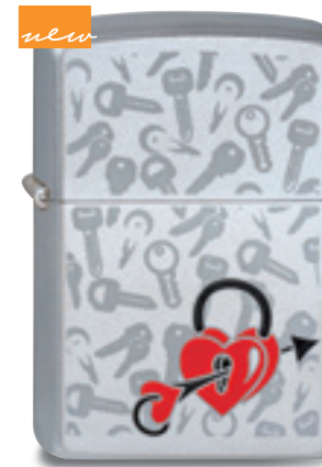
new Primer Love Locked 2.000.317 #205 · 31,- €