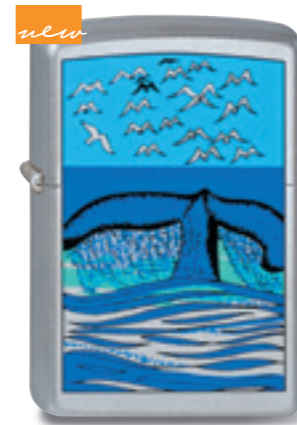
Whales Tail 2.000.298 #205 · 39,95 €