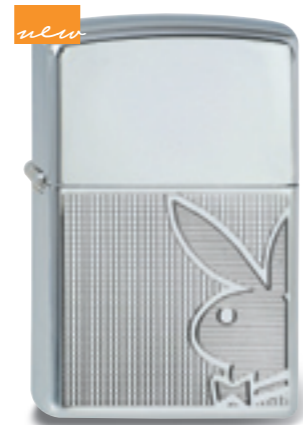
Playboy Square 2.000.380 #250 · 46,95 €