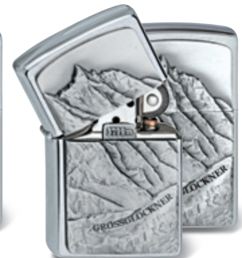
Grossglockner 2.000.211 #200 · 46,95 €