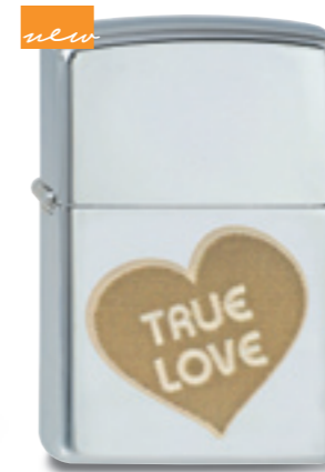
new True Love 2.000.308 #250 · 41,95 €