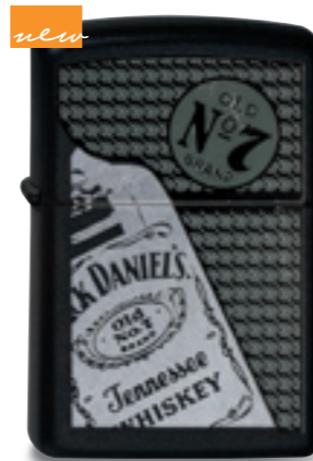
Jack Daniel's Bottle 2.000.418 #218 · 65,- €