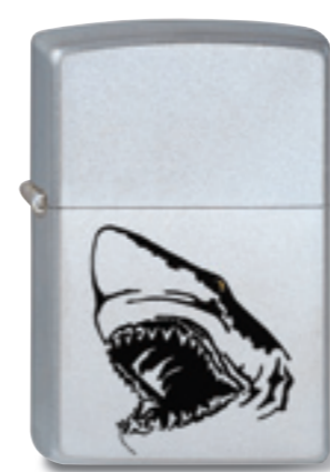
Shark 1.420.048 #205 · 49,95 €