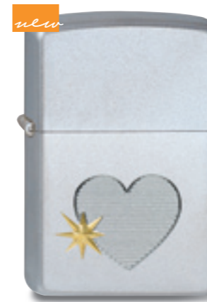
new Star Heart 2.000.321 #205 · 39,95 €