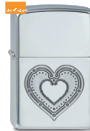
new Heart Design Dots 2.000.303 #250 · 41,95 €