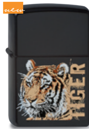
new Tiger 2.000.296 #21064 · 46,95 €