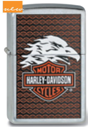
HD Eagle 2.000.377 #207 · 41,95 €