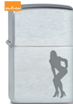
Lady & High Heels 2.000.315 #200 · 31,- €