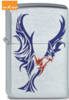
Tattegle 2.000.397 #207 · 35,- €