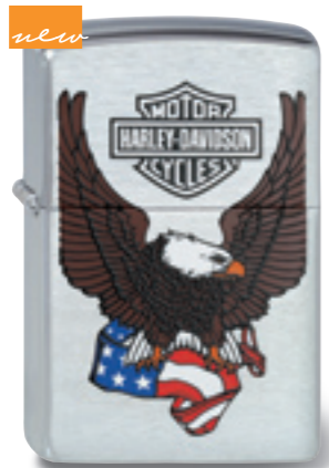
Harley-Davidson Flag 2.000.379 #200 · 52,- €