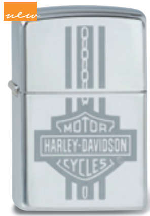
HD Chain 2.000.376 #250 · 49,95 €

HARLEY-DAVIDSON OFFICIAL LICENSED PRODUCT