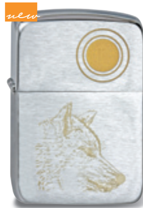
new Wolf/Moon 2.000.371 #1941 · 46,95 €