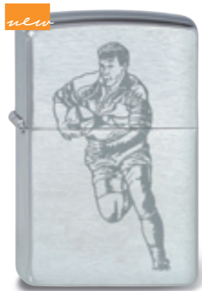
Rugbyman 2.000.370 #200 · 39,95 €