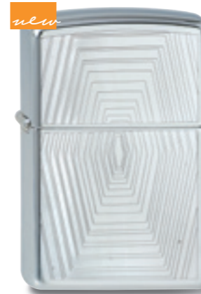
Geometric Windows 2.000.359 #250 · 41,95 €