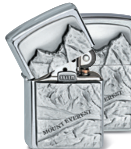
Mount Everest 2.000.215 #200 · 46,95 €