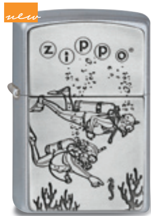
Diver 2.000.386 #205 · 42,50 €