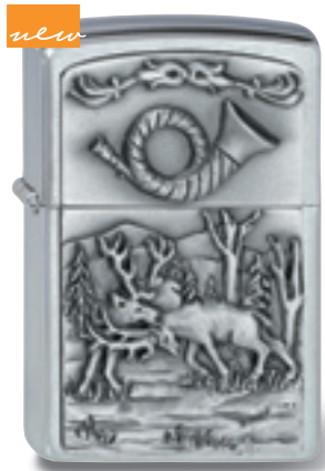
Deer 2.000.242 #200 · 46,95 €