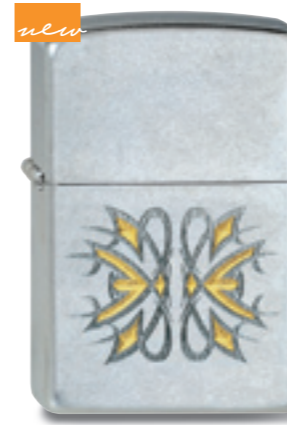
Abstract Butterfly 2.000.360 #207 · 39,50 €