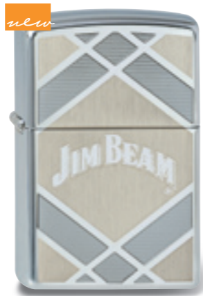
new Jim Beam 2.000.335 #250 · 59,95 €