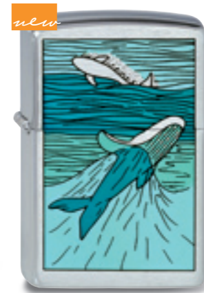
Whales Jumping 2.000.299 #205 · 41,95 €