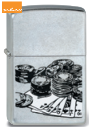
Poker 2.000.364 #207 · 31,- €