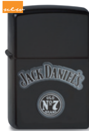
Jack Daniel's Old No 7 2.000.416 #21064 · 49,95 €