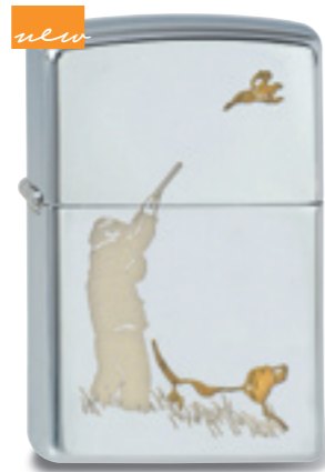
Hunting Birds With Dog 2.000.297 #250 · 41,95 €