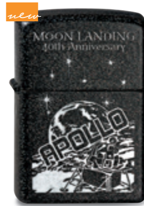
Moon Landing 40th Anniversary 2.000.385 #24650 · 49,95 €