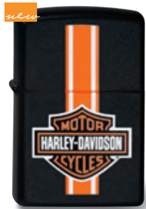
Harley-Davidson Stripes 2.000.375 #218 · 46,95 €