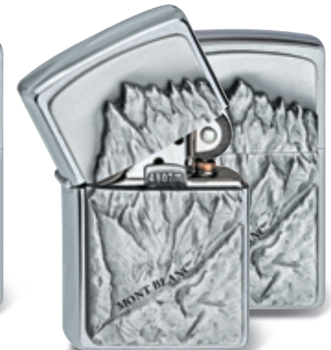
Mont Blanc 2.000.214 #200 · 46,95 €