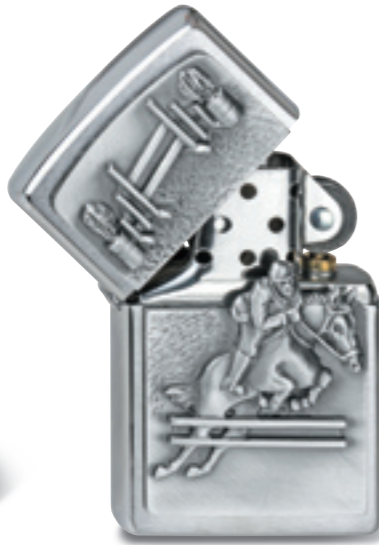
Show Jumping 2.000.395 #200 · 46,95 €