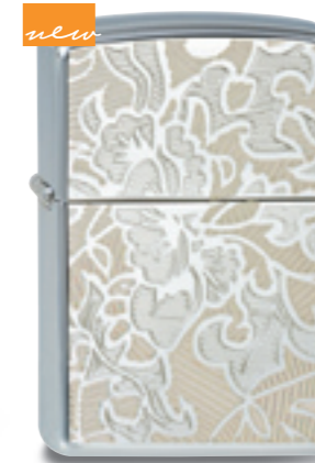
Flowers 2.000.324 #150 · 49,95 €