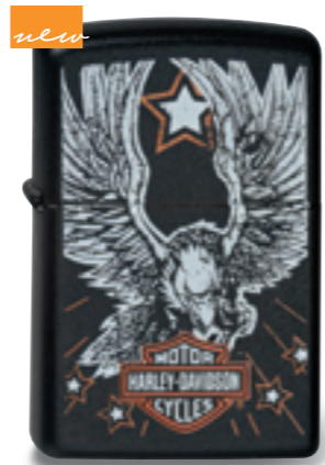
HD Eagle/Star 2.000.378 #218 · 52,- €