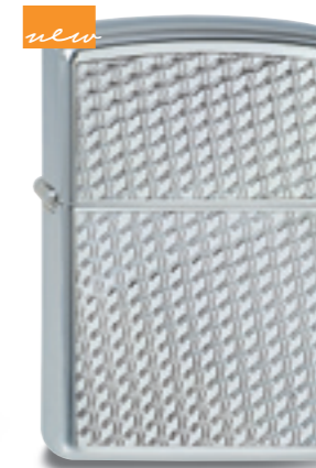
Ribbons 2.000.288 #250 · 41,95 €