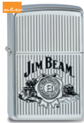
new Jim Beam Stripes 2.000.334 #250 · 46,95 €