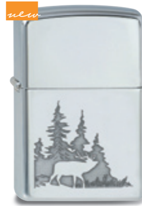
Elk in Trees 2.000.328 #250 · 41,95 €