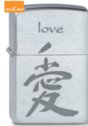
Japanese Signs Love 2.000.313 #200 · 39,95 €