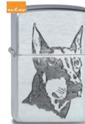
Doberman Pinscher 2.000.323 #200 · 39,95 €