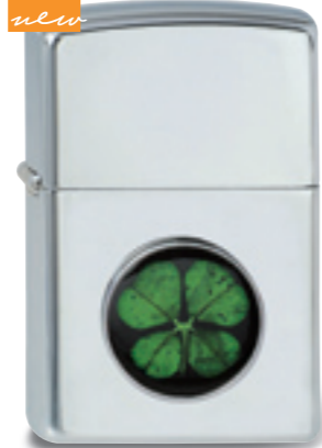
new Clover 2.000.338 #250 · 55,- €