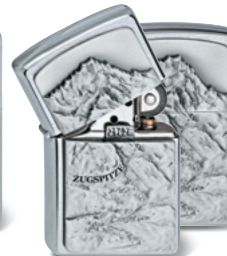
Zugspitze 2.000.210 #200 · 46,95 €