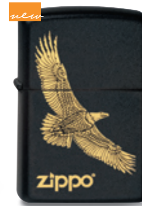
Zippo Eagle 2.000.329 #218 · 41,95 €