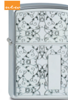
Venetian 2 2.000.310 #250 · 41,95 €