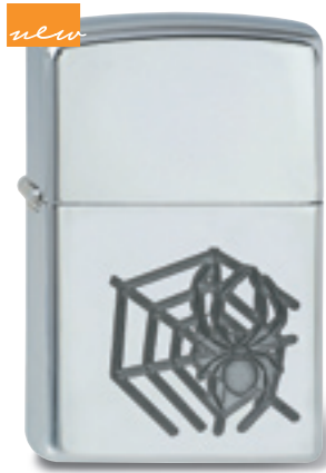
Spider & Web 2.000.368 #250 · 41,95 €