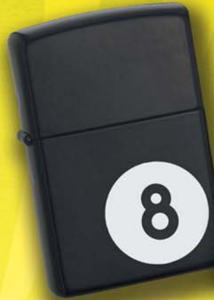
24331 8-Ball 24331-9