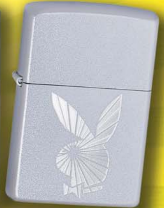
24309 Playboy Starburst 24309-8