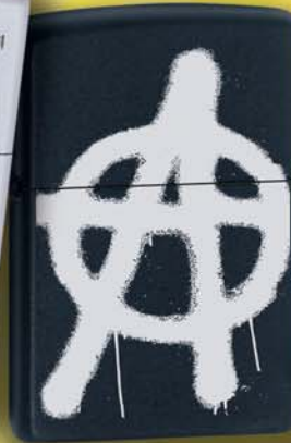
24334 More Anarchy 24334-0