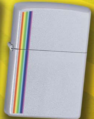
24340 Colorz 24340-1