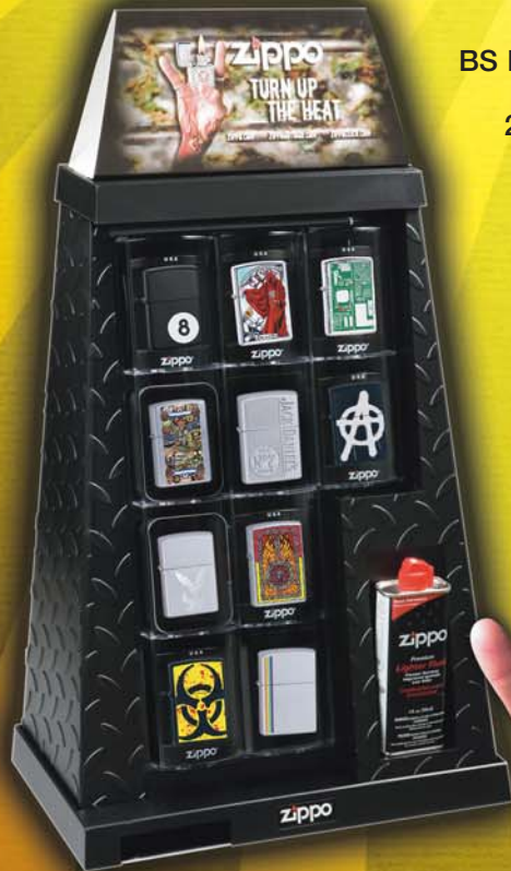
24265 BS Burning Chains 24265-7