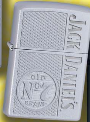
24245 Jack Daniel's® 24245-9