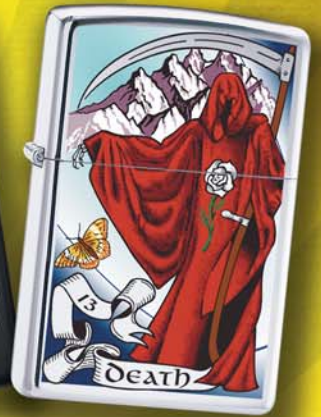
24328 Tarot Death Card 24328-9