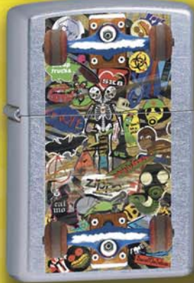
24327 Skateboard Graffiti 24327-2